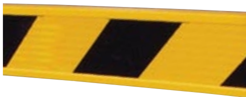
REFLECTIVE BARRIER BOARD